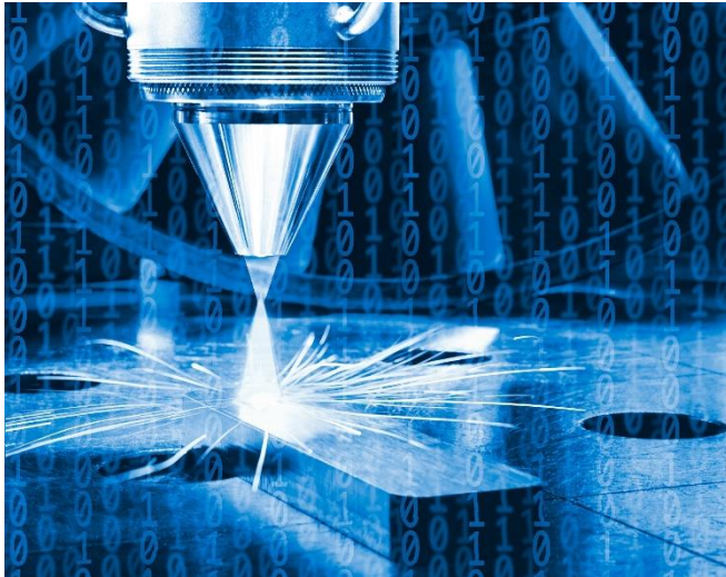
Image 2: AI for Laser Technology Conference: AI can also add significant value to laser deposition welding.

FRAUNHOFER INSTITUTE FOR LASER TECHNOLOGY ILT